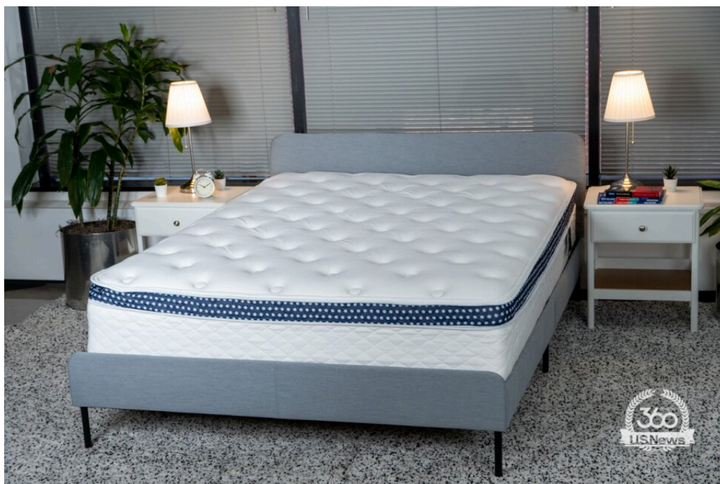
The WinkBed Mattress