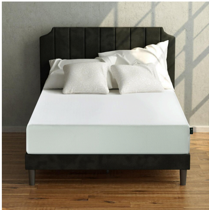
The Zinus Green Tea Memory Foam Mattress