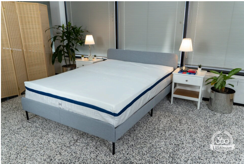
The Helix Midnight Mattress