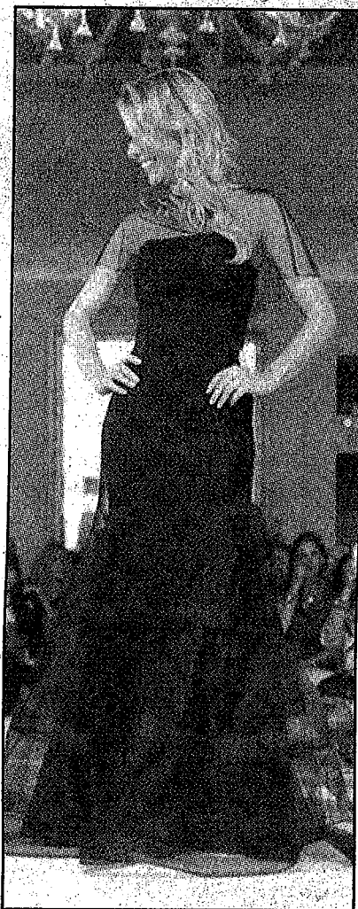
A model on the runway

"It has a metropolitan feel," she said. "We have such good access to everything the city has to offer. It's a great location. I love it around here."